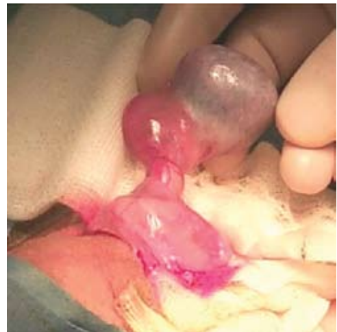
Figure 1. Torsed testicle.

If there is a history of scrotal trauma, it can be tempting to attribute scrotal pain